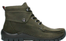
04725 Jump Winter