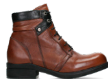
02628 Center WP