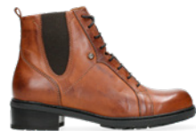
04481 Volga XW