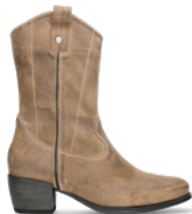
02880 Caprock HV