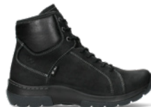
03030 Ambient WP