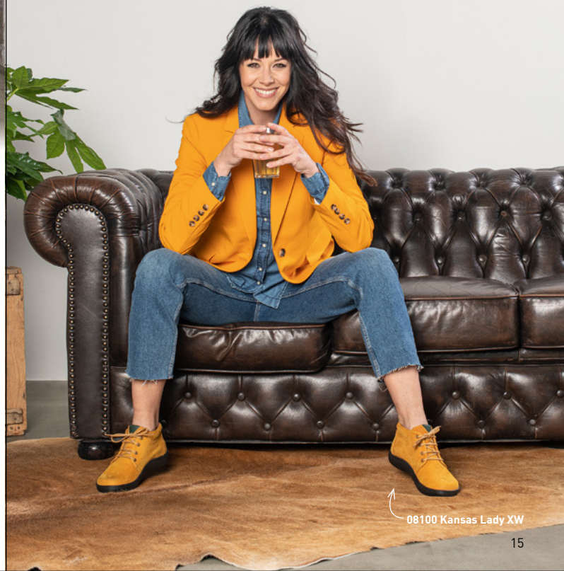
08100 Kansas Lady XW