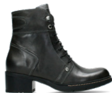
01266 Red Deer XW