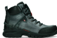
06500 City Tracker WP