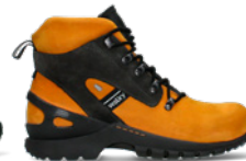
06505 Traction WP