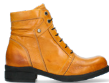
02629 Center XW