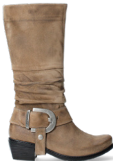
00456 La Banda