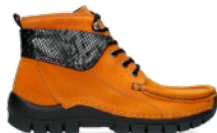
04725 Jump Winter