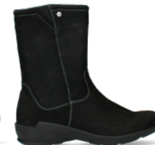
01578 Sole WP