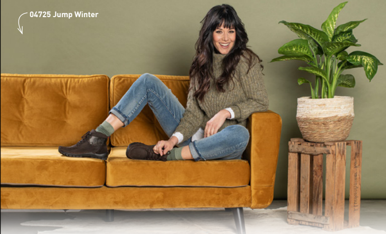
04725 Jump Winter