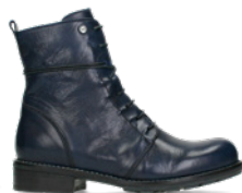
04444 Murray XW