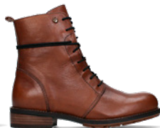
04445 Murray HV