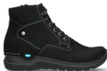
06616 Whynot HV