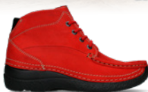
06242 Roll Shoot