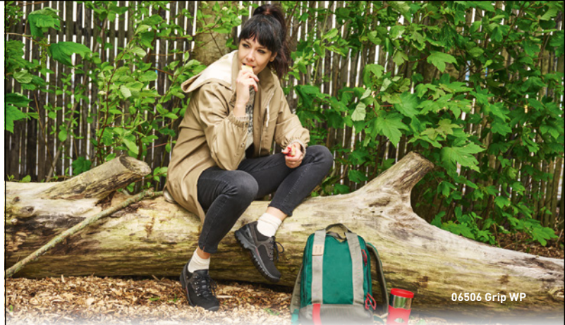
06506 Grip WP