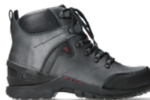
06500 City Tracker WP