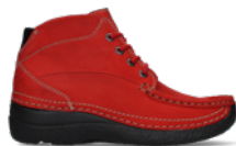
06242 Roll Shoot