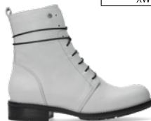
04444 Murray XW