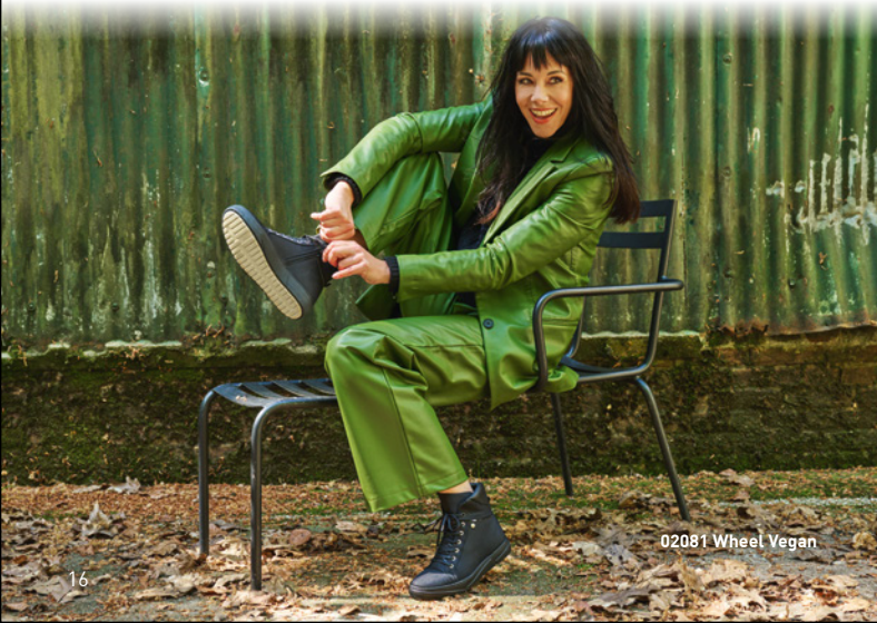
02081 Wheel Vegan