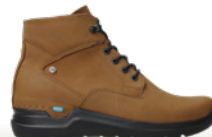
06616 Whynot HV