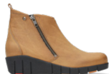
01782 Phoenix HV