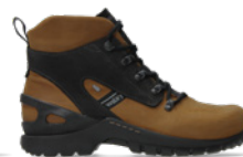
06505 Traction WP