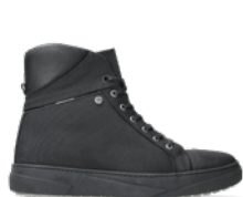
02081 Wheel Vegan