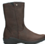
01578 Sole WR