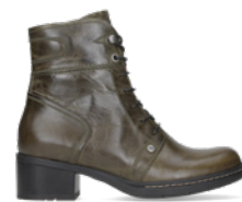
01260 Red Deer