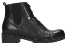
04481 Volga XW