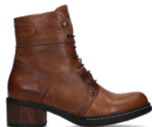
01266 Red Deer XW