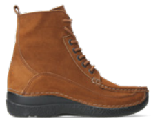
06201 Roll Boot