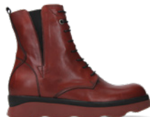
02978 Akita HV