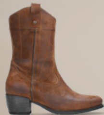
02880 Caprock HV