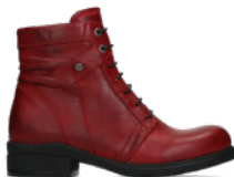
02629 Center XW