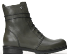
04445 Murray HV