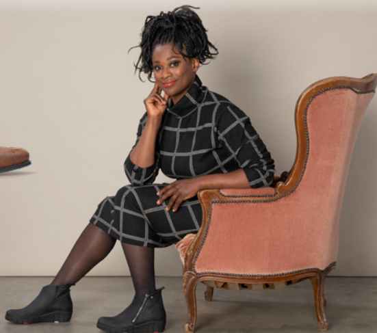
01782 Phoenix HV